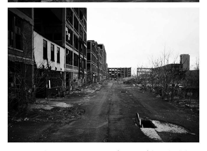
Figure 5: Camilo Jose Vergara. Sequence of pictures of the Packard Plant in Detroit. VERGARA, Camilo J. Detroit Is No Dry Bones: The Eternal City ofthe Industrial Age . Univ. Of Michigan Prss. Ann Arbor, 2016.

Detroit is a giant factory created by the logic of industrial production and circulation. As any other industrial facility, Detroit has in its DNA the seed of its own destruction. For an industrial building, and for the industrial city, "dysfunction is the prelude to ruin."<sup>21</sup>