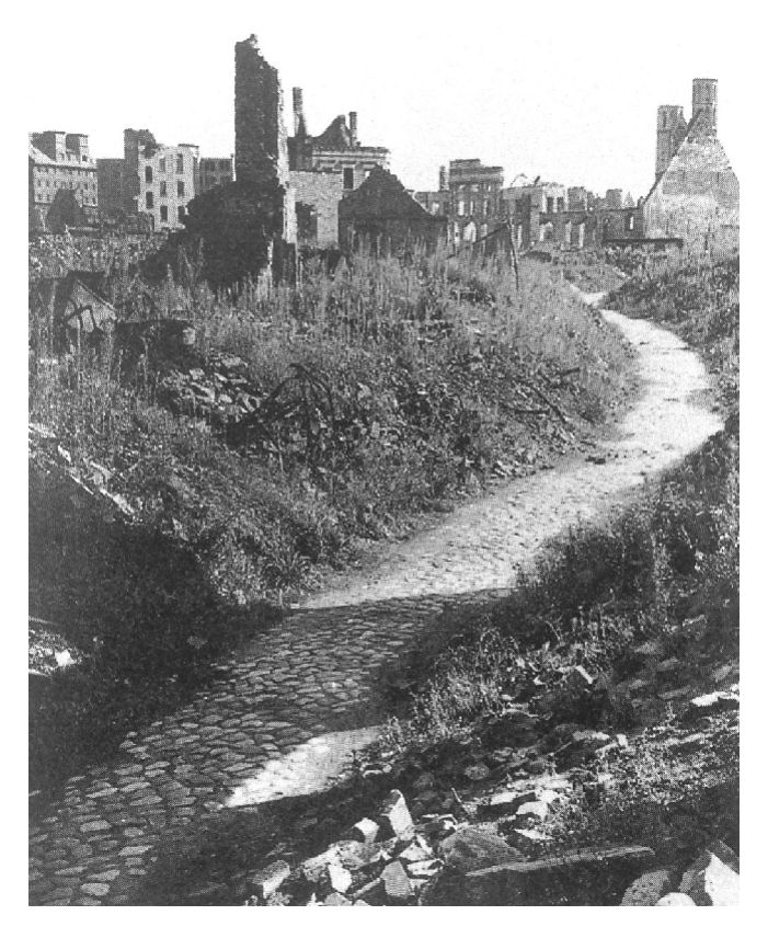
Figure 1: SEBALD, WG. On the Natural History of Destruction. The Modern Library. New York, 2004. Picture of a bombed German city.

places that ruins create, transforming them into monuments. In the following parts of the paper, we will review the different phases of assessment of ruins in history, and then after reviewing the relationship between modernity and ruins, we will center our attention on the city of Detroit, explaining its essential characteristics as a ruined city and analyzing its possible future evolution.